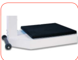
Wheels to move