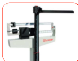
Telescopic height rod