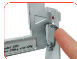
Lock beam scale